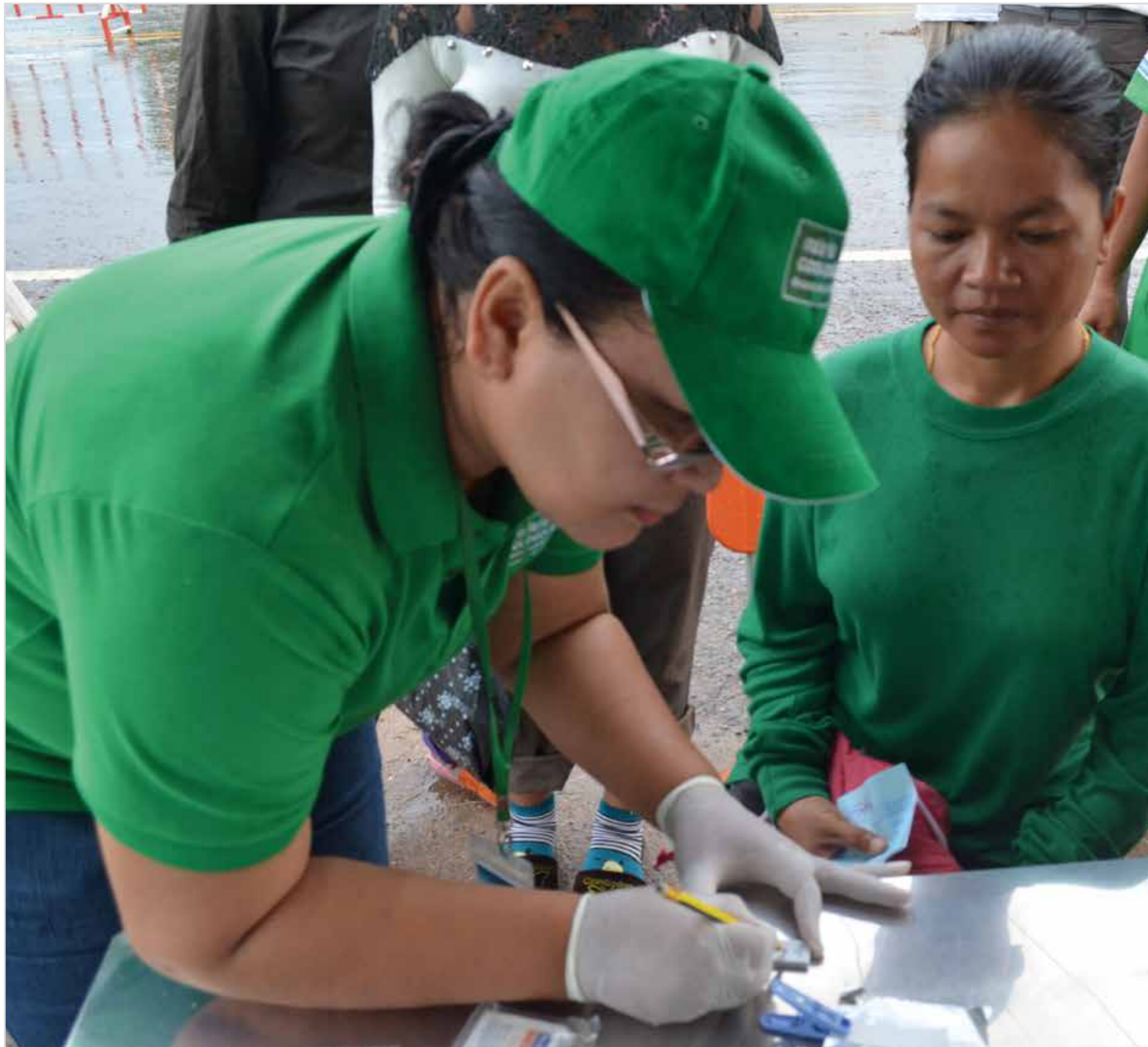
Migrant workers are tested for asymptomatic malaria to help track and reduce transmission at the Thai-Cambodia border

Resistance to Artemisinin Combination Therapies (ACTs), the most effective drugs we have to tackle malaria, is growing. It is already a significant threat to health in Southeast Asia and will be a global threat if it spreads further.