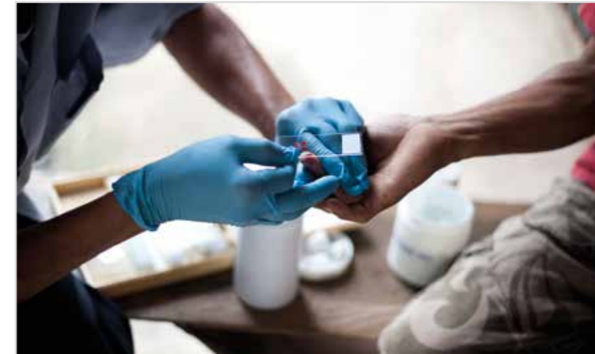
Testing for malaria in Thailand using a malaria rapid diagnostic test.

investment and lead to a dramatic increase in malaria cases and deaths. The global community must work towards the total elimination of malaria. To achieve this, we require effective tools to prevent, diagnose and treat the disease. As has been demonstrated by the past loss of effective treatments, one of the greatest challenges ahead is the rise and spread of drug resistant malaria.