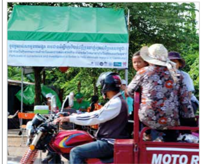
Malaria Consortium staff at a border check point between Cambodia and Thailand encourage people crossing the border to be tested for malaria