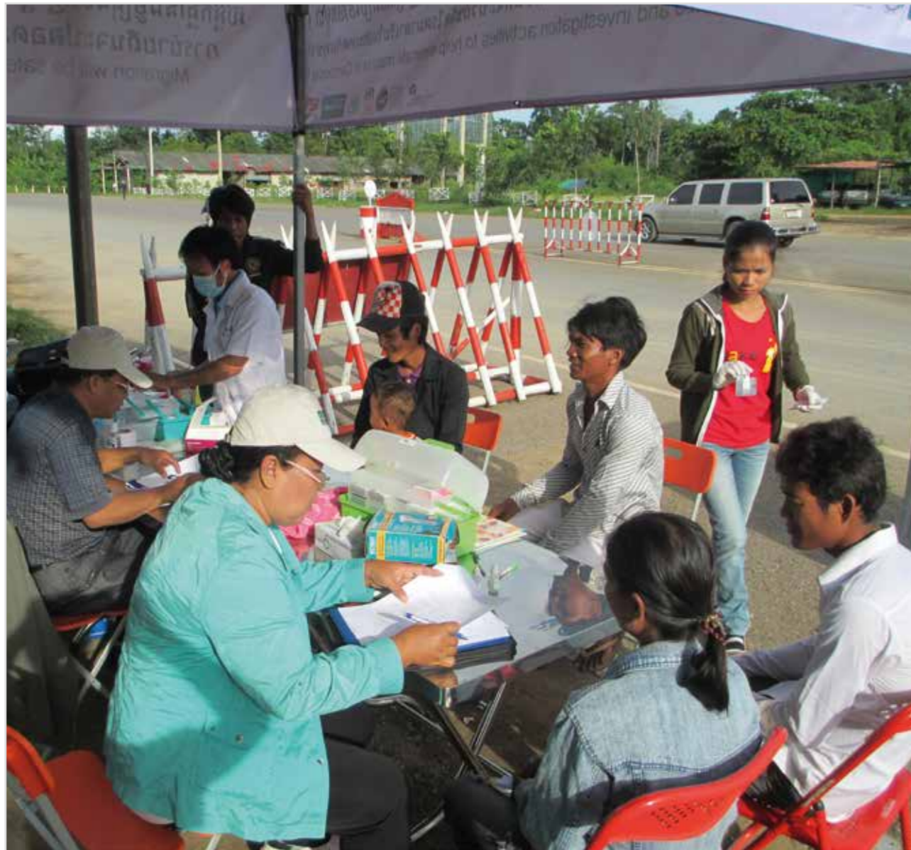
Border-crossers are screened at a checkpoint on the Cambodia-Laos border as part of efforts targeting malaria infection and artemisinin resistance