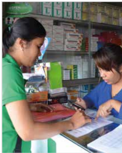
Malaria case data are collected from private providers

In the early 1900s, malaria was endemic to most countries in the world. Following failed malaria elimination efforts in the 1950s and 1960s, there was a reduction of malaria control efforts which resulted in a significant resurgence in cases in many countries. Even 20 years ago, the idea that malaria could be eradicated was unthinkable. The disease was killing more than one million people a year worldwide, most of them children.