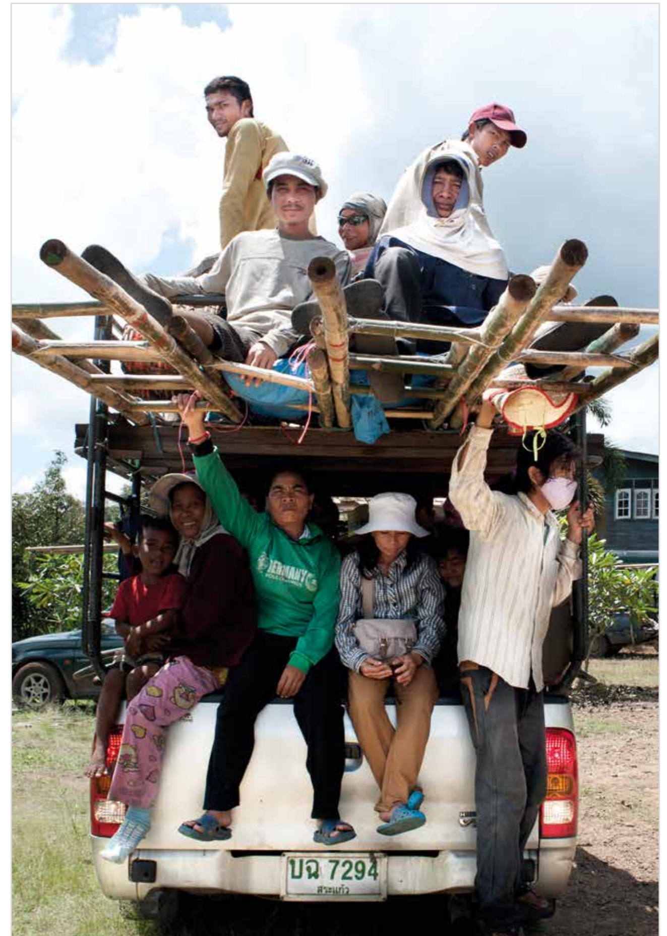
Cambodian migrant workers in Thailand taking part in an antimalarial drug resistance study