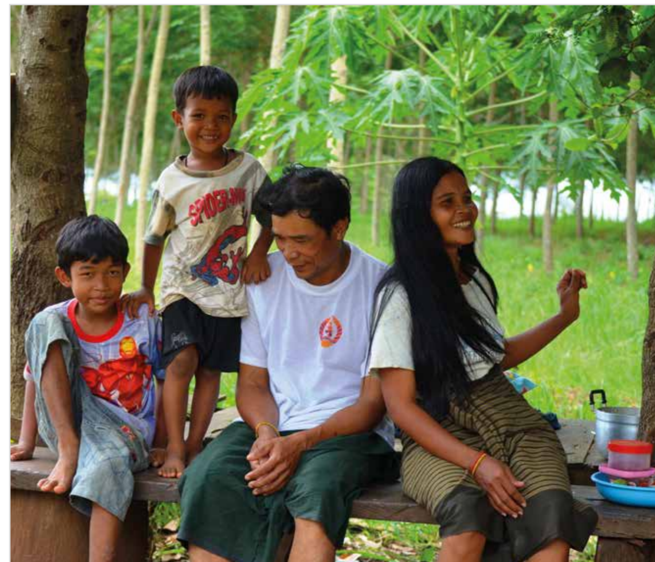
Migrant and mobile populations, such as this family working in a plantation in Pailin, Cambodia, are most at risk of malaria

As we move forward from the MDGs and begin work towards achieving the SDGs, sustained political will for combating malaria is crucial. MDG 6(c), which called on the international community to halt and then reverse malaria rates by 2015, provided the impetus for a large mobilisation of resources and political will. However, with 17 goals covering a broader range of areas of development, the SDGs do not include such a strong focus on malaria. There is a risk, therefore, of losing the momentum of the past 15 years and the substantial progress made in tackling the disease. This is despite the significant impact that reducing malaria will have on a wide number of the SDGs; from reducing poverty, tackling hunger and increasing school attendance, to boosting economic growth, supporting gender equality and tackling climate change. 5 It is therefore important that political advocates continue to press for investment in malaria elimination.