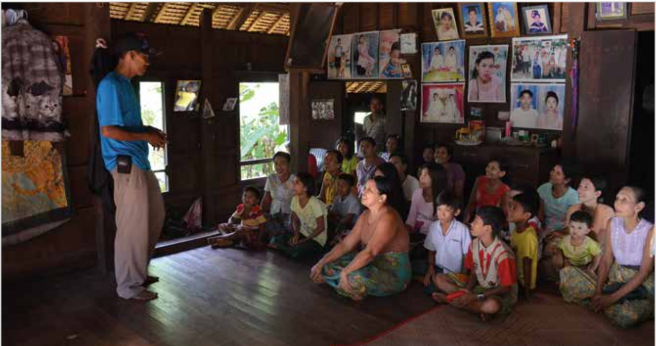
Community members in Kyun Su township, Myanmar gather to learn about health-seeking behaviours for malaria

The growth of resistance to antimalarial drugs, as well as antimicrobials, with which the issue shares many similarities, threatens to return the world to a time when parasitic diseases or simple bacterial infections often resulted in death. If we are to sustain progress in the fight against malaria and achieve the ambitious SDG for health, it is vital that we limit and prevent resistance. Continued investment in all areas of the elimination strategy outlined above will be required. In particular, it is crucial that funding is maintained in countries that are close to elimination, which is often a challenge for resource allocation when the disease burden decreases and other health concerns become more pressing. As a world leader in tackling malaria, the UK has an important role to play in keeping malaria high on the international agenda. The UK can continue to encourage other donors and endemic countries' governments to keep investing in elimination efforts until every case has been treated and the threat from drug resistance has been defeated.